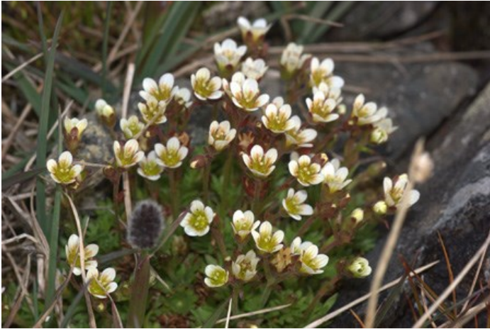
Tufted saxifrage in Spitsbergen.

Emissions from Europe and Russia add to the deposition of acid rain in Svalbard. Nitrogen and sulphur are stored in the snow and may be released in high concentrations during the thaws. Woody plants and dwarf shrubs are affected because the mycorrhiza (the symbiotic relationship between specific fungi and the plants' root systems) is damaged by acidity, and nutrient uptake therefore suffers. Lichens and mosses are also very sensitive to nitrogen deposition.