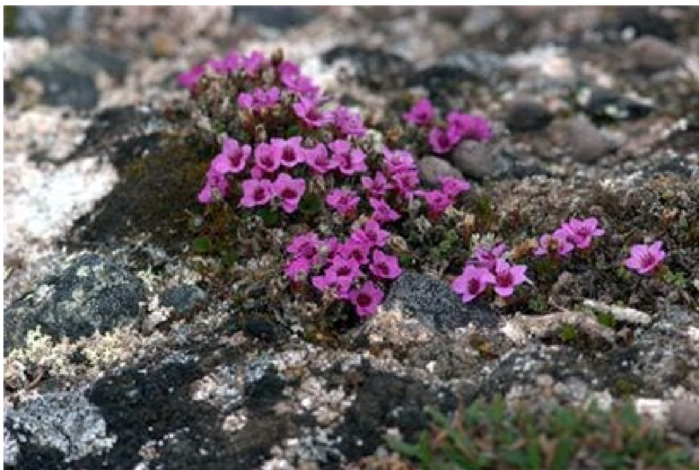
Purple Saxifrage.

Glaciers cover 60 per cent of Svalbard's land area, and much of the remaining area is mountainous. The terrain is often steep and includes large areas of scree and moraine. Less than 10 per cent of the area is covered by vegetation. However, the climate is relatively favourable for plant growth. Low-lying valleys, plains and coastal areas are generally covered by vegetation to some extent. The plants are small and seldom more than 20 cm tall. There are no upright trees or bushes, and the only woody plants are low or creeping dwarf shrubs.