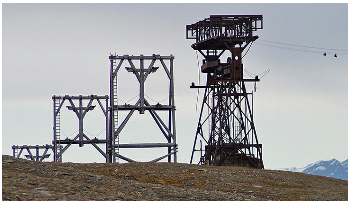
Ropeway for transporting coal in Longyearbyen, Svalbard.

The Governor also acts as chief of police and environmental authority for the whole of Svalbard. In addition, the governor's office also has a wide range of administrative duties in fields such as population registry, civil matters, child welfare, rescue services, pollution control and oil spill containment, nature conservation, cultural heritage management, and wildlife and freshwater fish management.