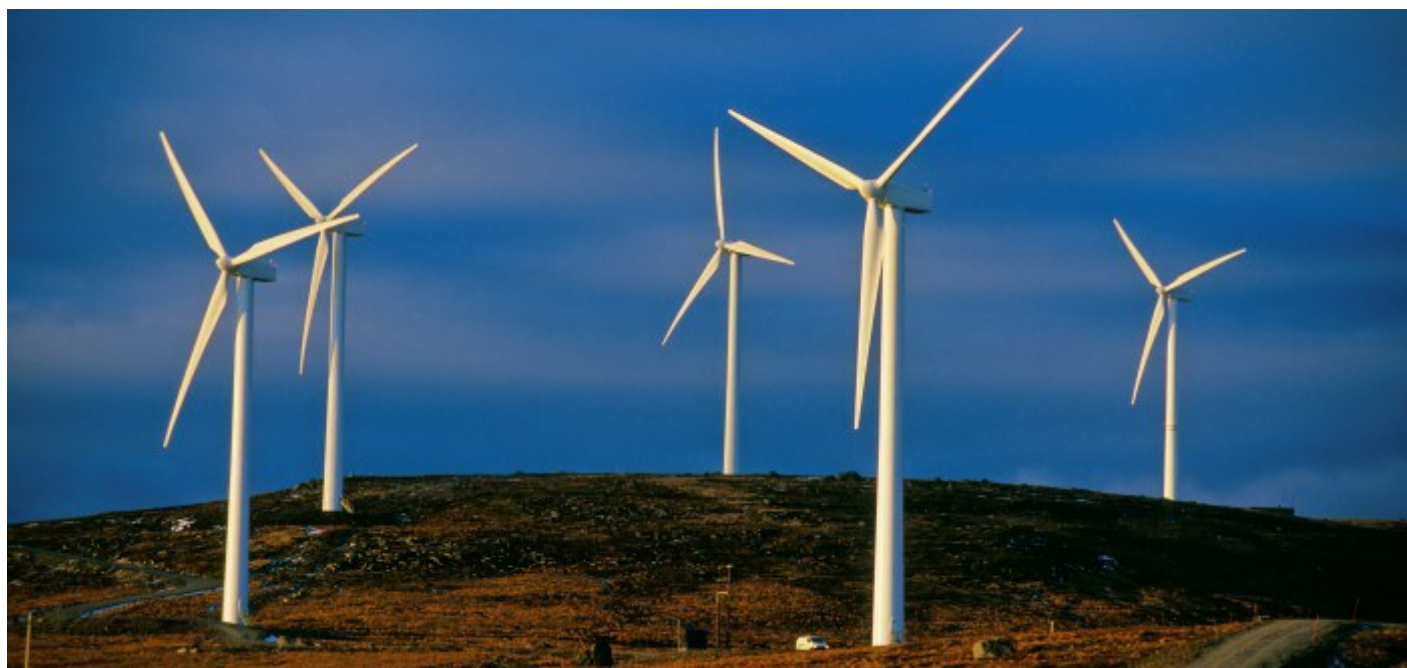
Wind power plants and their infrastructure often come into conflict with undisturbed nature. From Vågsøy, Sogn og Fjordane county.

Many people still think of Norway as a country with wide expanses of more or less undisturbed countryside. However, more intensive use of natural resources is putting growing pressure on these areas, and the area classified as “without major infrastructure development” is much smaller than only thirty or forty years ago.