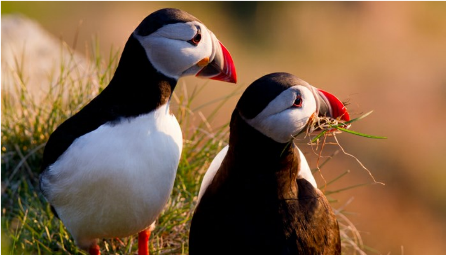
Puffins, one carrying nesting material. The Atlantic puffin is the most numerous seabird in Norway, but a number of colonies have declined steeply.