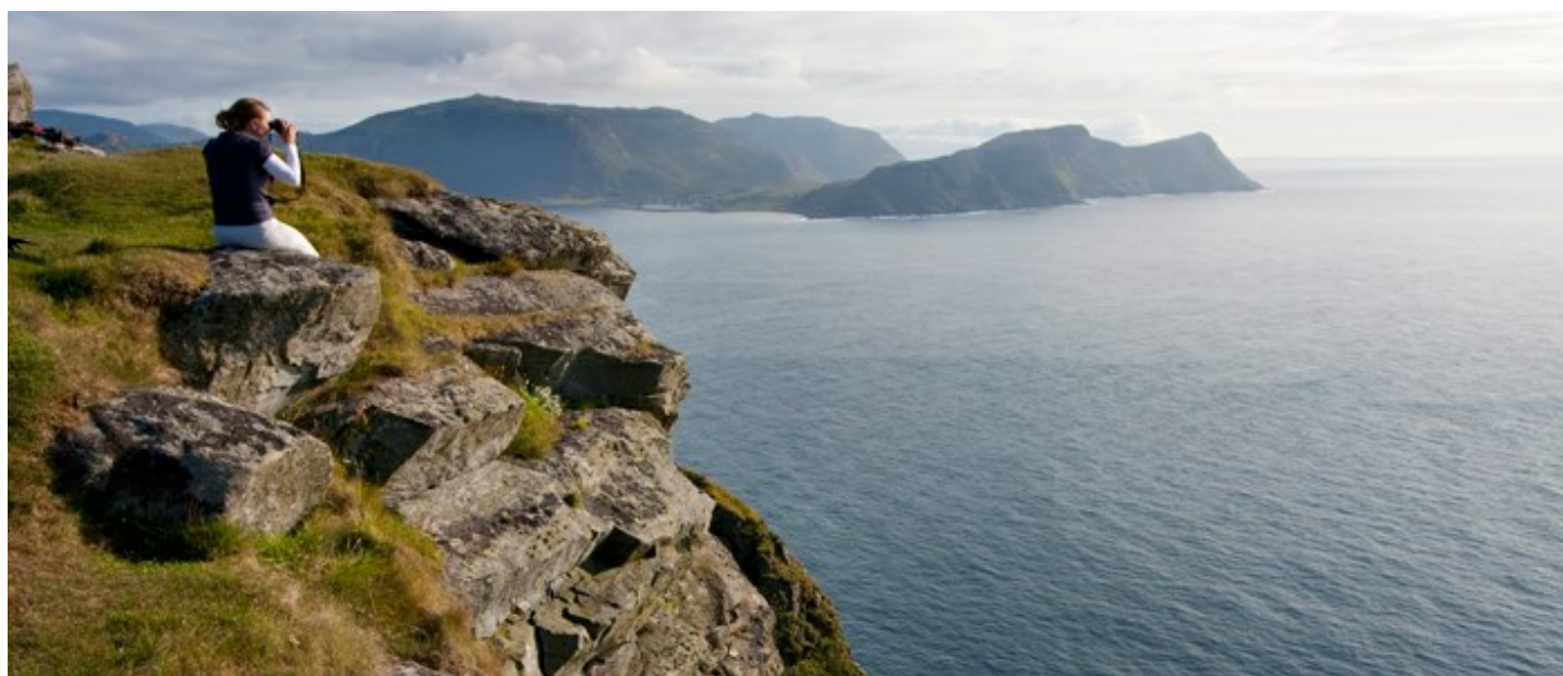
The spectacular clifftop view from the west side of Runde island, home to huge numbers of nesting seabirds.

The Norwegian Sea is the part of the North Atlantic between Norway, Svalbard and Iceland. Its environmental status is considered to be generally good, and much of the water column and deep seabed is relatively undisturbed. However, certain species and areas are clearly affected by human activity.