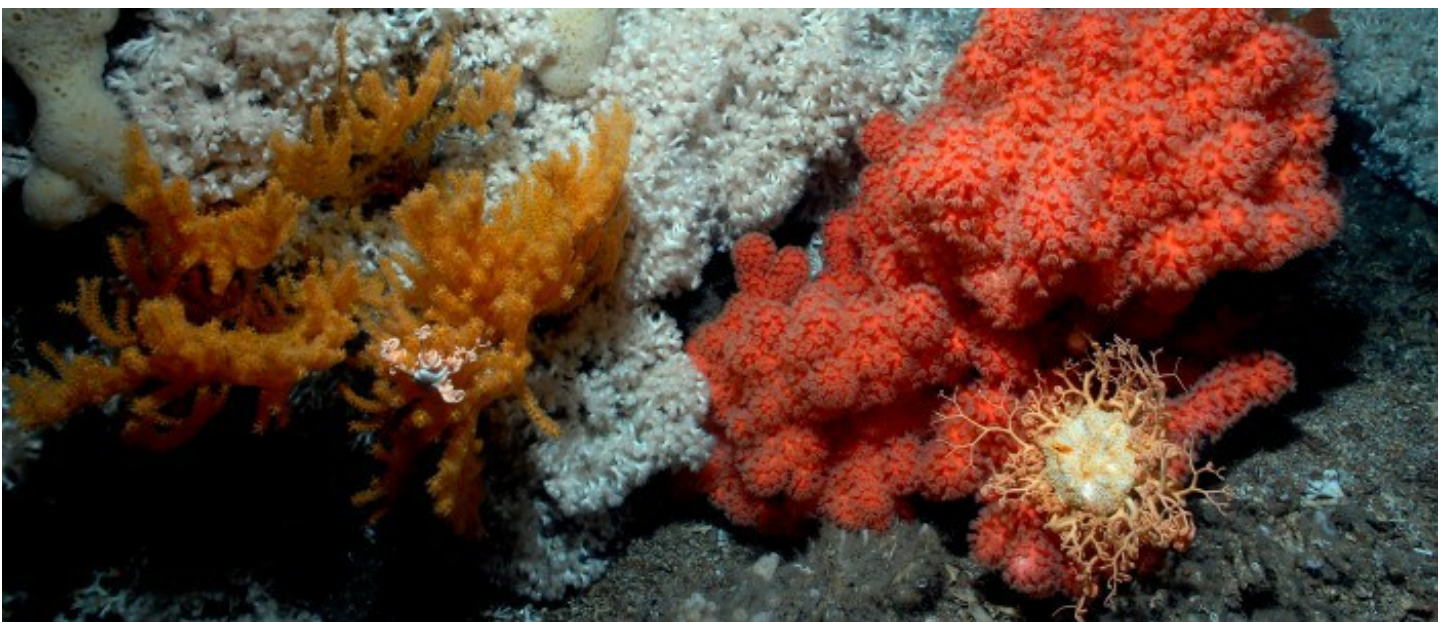
The cold-water corals Lophelia pertusa and Paragorgia arborea and a Gorgonian's head seastar on a moraine ridge in the Trondheimsfjord. The two coral species are classified as near threatened in the Norwegian Sea.