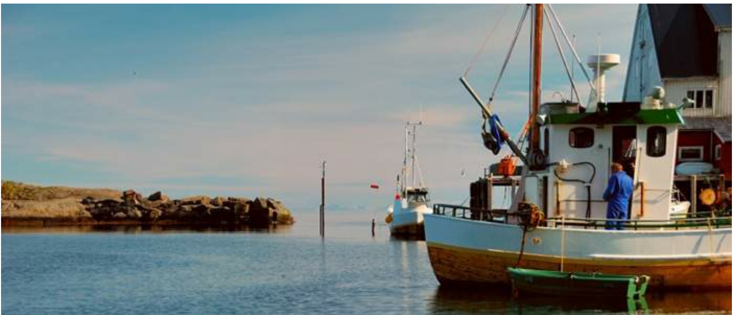
Fisheries are bound to have some impact on ecosystems, and it is essential to find a good balance between conservation and harvesting.