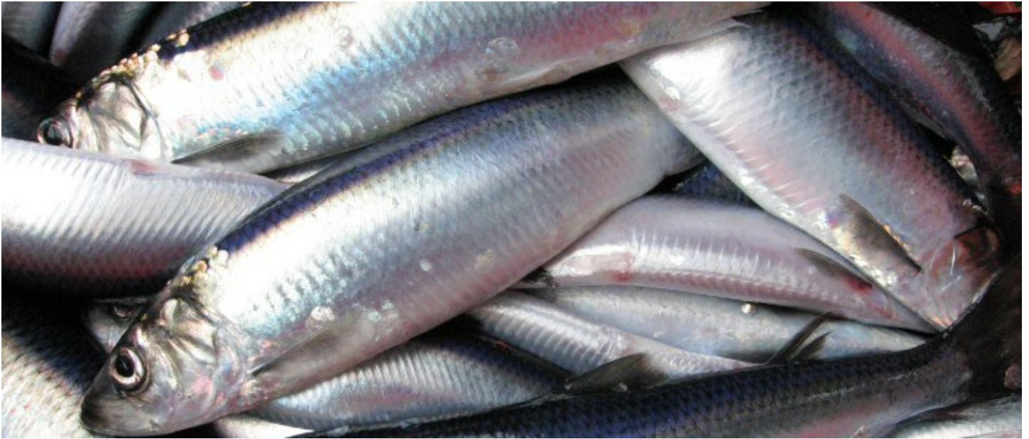
Herring from the Norwegian spring-spawning herring stock, the largest in the world. They spawn mainly off Møre og Romsdal county in February–March, but also further north off Nordland county and around the Vesterålen Islands. After spawning, the adult herring move into the Norwegian Sea.